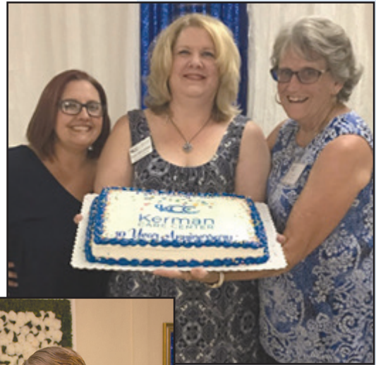
Current and Past Executive Directors